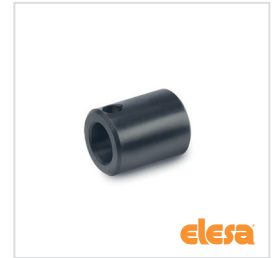
ELESA Original design RB51/RB52/RB50